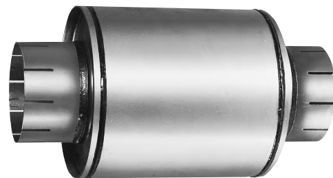
5" (125mm) I.D. and O.D. - Part No. M090072 4" (102mm) I.D. and O.D. - Part No. M090362