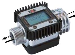
ELECTRONIC METER - K24