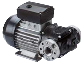
AC PUMP - E120