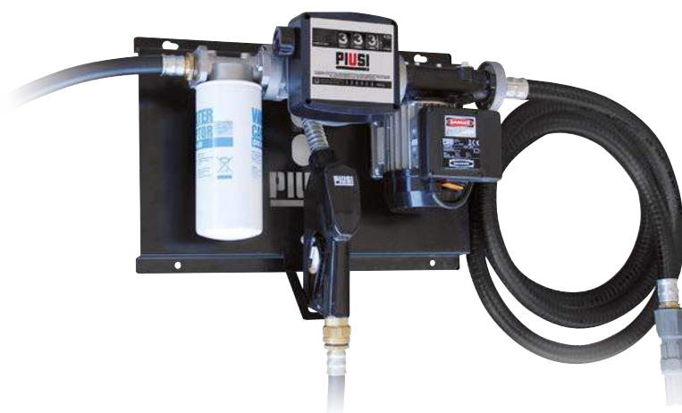
ST PANTHER 56, K33, A60 AND WATER CAPTOR