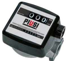
MECHANICAL METER - K33