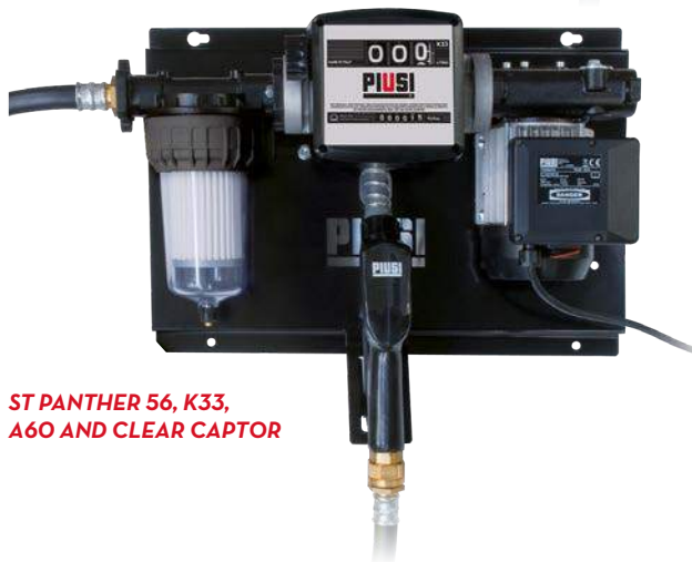
ST PANTHER 56, K33, A60 AND CLEAR CAPTOR