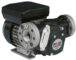
AC PUMP - PANTHER 56/72